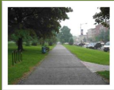
Permeable sidewalk demonstration. Taylor Park - St. Albans, VT.

Installing pervious (porous, permeable) concrete and asphalt parking lots, sidewalks and pavers is an effective strategy for reducing stormwater runoff given the proper conditions. Routine maintenance to prevent clogging and erosion control is essential, and the cost of pervious asphalt is approximately 20-25% more than traditional asphalt. Concrete costs are comparable. For northern climates, the benefits include reduced black ice, groundwater recharge continues in freezing temperatures, and surface traction is maintained when wet.