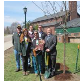
Tree Campus USA ceremony at UVM.