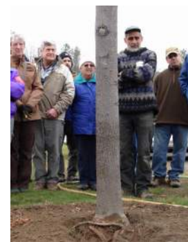
Tree Stewards Conference

When J. Sterling Morton founded Arbor Day in Nebraska in 1872, he likely wasn't envisioning future celebrations involving bug muffins and emerald ash borer (EAB) pizza. But here we are 144 years later and the VT UCF team is taking Arbor Day on the road to Johnson, where restaurants will be serving EAB-themed fare to bring awareness to local efforts to plan for the arrival of the invasive forest pest. Of course, that's not all; two trees will be planted at Johnson Elementary School, Johnson State College students will be giving a presentation on a campus ash tree inventory they have conducted, the official Vermont Arbor Day proclamation will be read, and just maybe a UCF staff member will be visiting elementary classrooms dressed as an EAB purple trap. Saturday, in conjunction with Green Up Day, there will be informational displays, EAB-themed games, and a "sASHay" along Main Street to highlight the 60 trees planted as part of a new downtown streetscape.