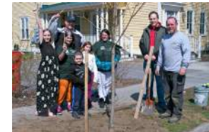
Neighborhood tree planting in Burlington sponsored TD Bank.