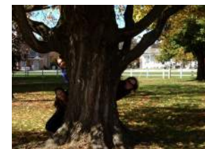
VT UCF team inventorying trees on the Fair Haven green.