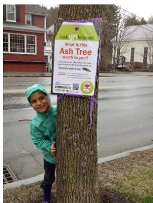
A little rain couldn't stop the ash tagging in Stowe!