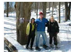
Ash tree tagging in Montpelier by the Tree Board