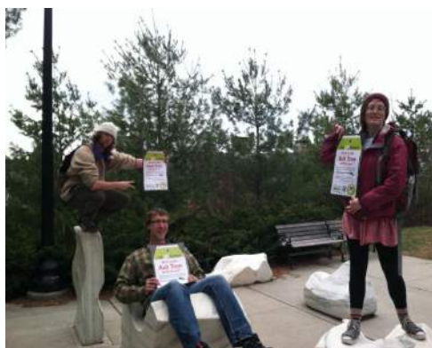
UVM Students helped tag ash trees on the Burlington waterfront.