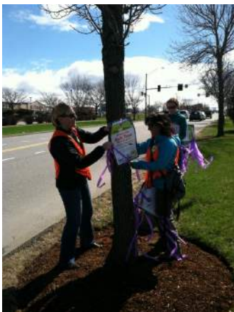
VT UCF and Williston volunteers tagged over 150 ash trees.

See more highlights and learn more about Ash Tree Awareness Week at www.vtinvasives.org .