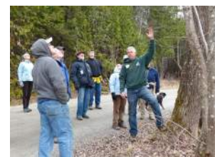
Tree walk in Peacham.