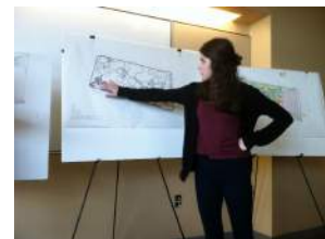
A UVM student shares a landscape design as part of VT's Village Green Initiative.

To request sets of the 2014 Tree Trading Cards please provide the information requested or contact Wendy Richardson - 802-828-1531 with the number of sets needed.