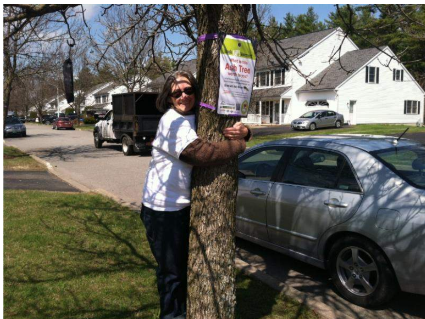
In South Burlington 168 trees we tagged that annually provide residents with $11,914 in environmental benefits! This is only 23% of the 741 ash street trees in South Burlington.

Sign up for our next webinar: Tree Planting 101 with Brian Sullivan, Burlington Arborist Technician, On May 29 from 12 - 1 PM.