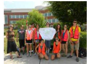
LANDS interns inventorying the trees in Essex Junction.