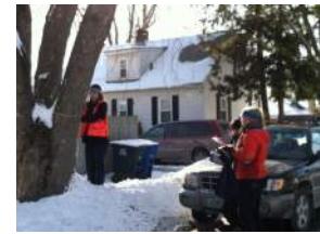
UVM students perform health assessments on ash and maples in Winooski