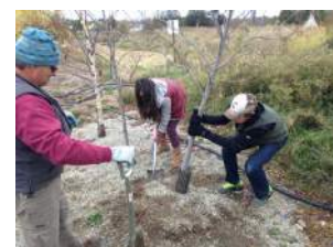
Digging trees in South Burlington's nursery.