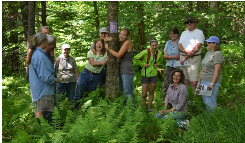
Johnson volunteers know that caring about their trees takes more than just hugging them, but they enjoy doing that too!

Johnson was selected to host 2014's Vermont Arbor Day celebration because of its proactive planning for EAB. The town is part of the Regional Invasive Insect Preparedness Team (RIIPT), a 5-town (Johnson, Morrisville, Cambridge, Fletcher, and Hyde Park) initiative that has been preparing for EAB by working on ash inventories and outreach in anticipation of a written plan. Vermont Electric Coop, the Lamoille County Planning Commission, and VT Cartography are also active partners of the RIIPT. Johnson will be the first town of the RIIPT to finish its EAB preparedness plan (and is happy to share it!), has a new Tree Board and a new Tree Warden, as well as a cadre of dedicated volunteers that regularly do outreach, conduct ash tree taggings, work with local students, and hold information meetings - all in an effort to be active stewards of the town's trees.