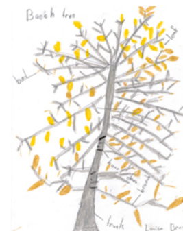
2011 First Grade Winner: Louisa Braun

Your students can win a set of tree trading cards and a free Day Use Pass to Vermont State Parks by completing Passport activities. The trading cards were created from the winning entries of our 2011 'Growing Works of Art' contest.