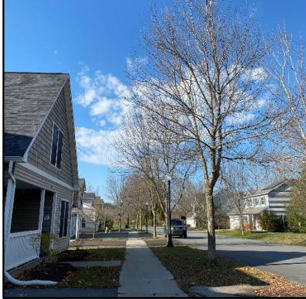
A dozen small ash planted at the same time that Church St neighborhood was developed will be replaced.