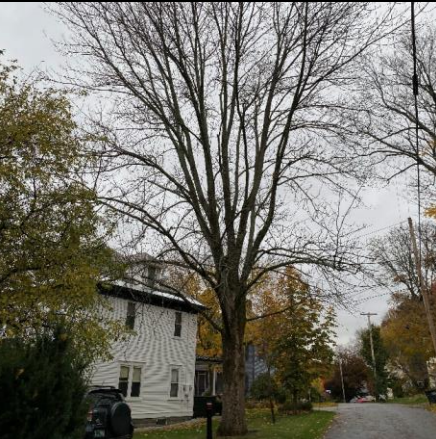
Large, healthy tree on Baker St to be treated.