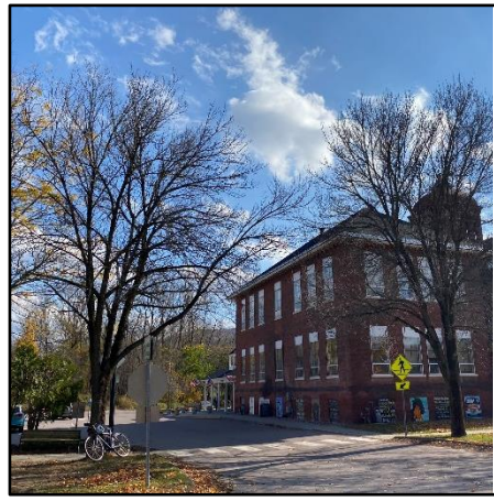
Healthy ash outside Town Center will be treated

Fig. 1. Proposed 2021 management for ash trees within Richmond's village and surrounding areas.