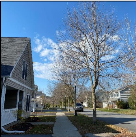
A dozen small ash planted at the same time that Church St neighborhood was developed will be replaced.