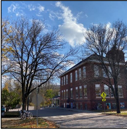
Healthy ash outside Town Center will be treated