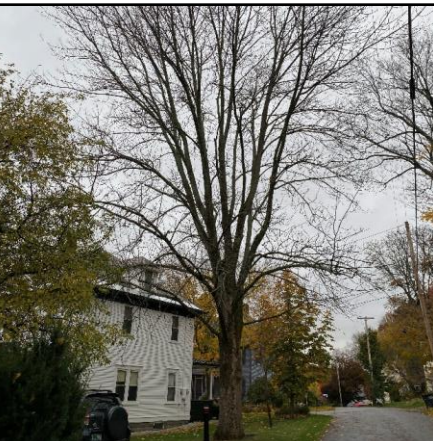
Large, healthy tree on Baker St to be treated.