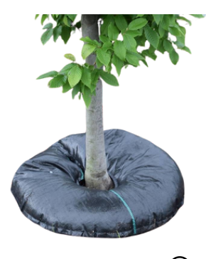
Tree Diaper,® approx. $40