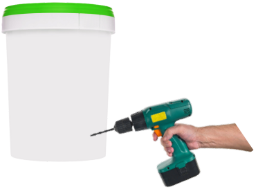
5 gallon bucket with holes for slow release