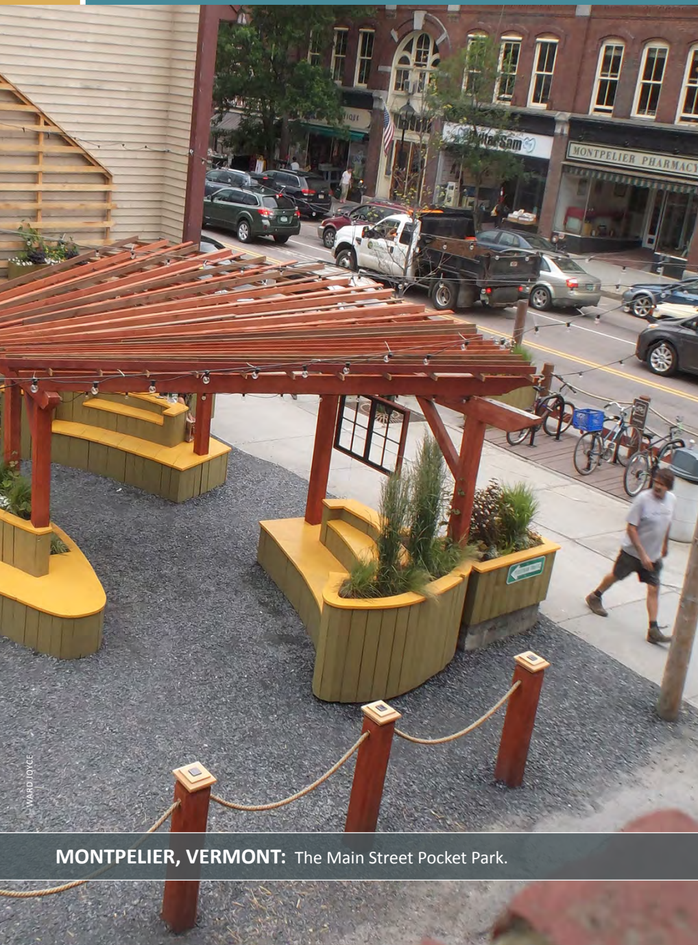
MONTPELIER, VERMONT: The Main Street Pocket Park.