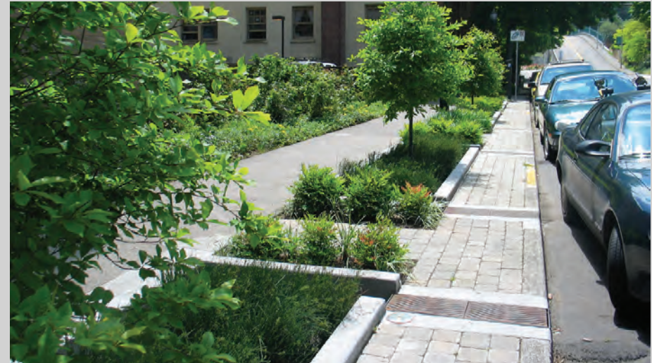
▲ This Green Street project utilizes a series of stormwater planters while maintaining on-street parking and adequate space for pedestrian circulation.

Active pedestrian use also provides educational opportunities to showcase the differences between conventional streetscapes and the functional landscapes of Green Street design. Sometimes, this can be accomplished through educational signage. In other instances, this may require low fences, rails, or exposed curbs to alert users of the presence and value of green infrastructure. Investment in outreach often gives users of the site a greater sense of responsibility to keep the site clean, care for the plants, and respect the overall space.