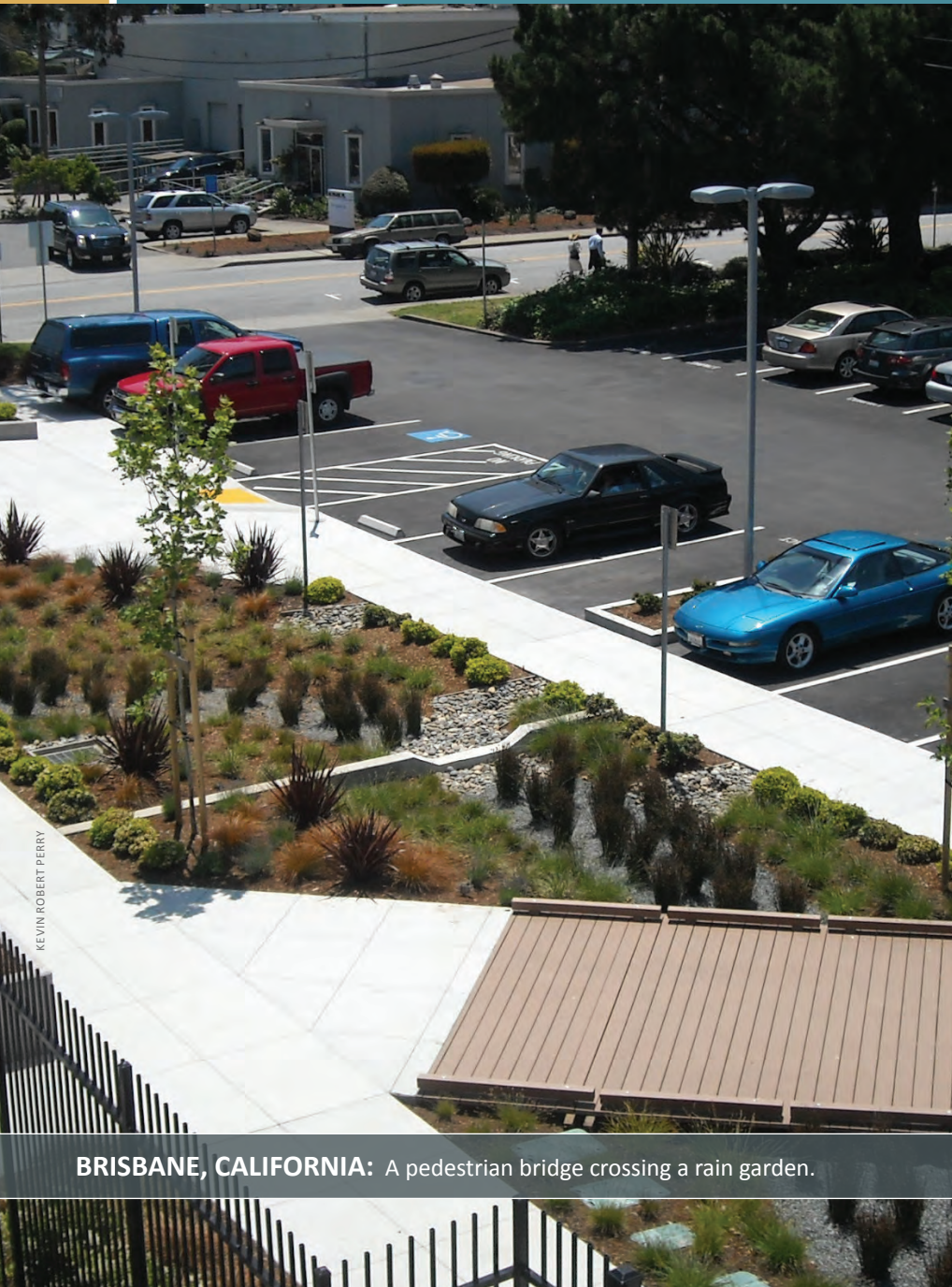
BRISBANE, CALIFORNIA: A pedestrian bridge crossing a rain garden.