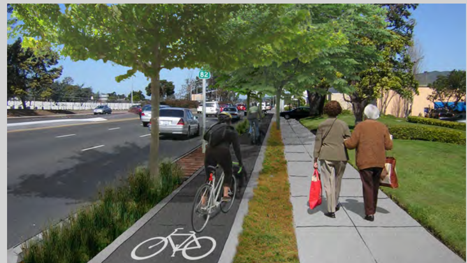
▲ This bold Green Street project separates bike, pedestrian, and vehicular movements with vegetated swales and stormwater planters.