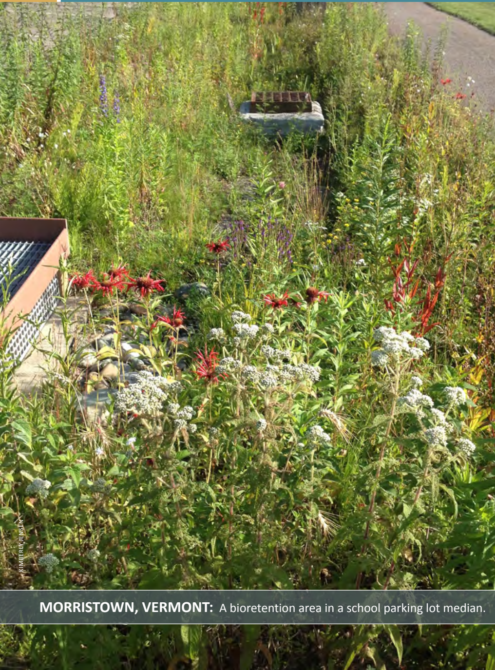
MORRISTOWN, VERMONT: A bioretention area in a school parking lot median.

Aligning street and parking lot use and long-term Green Street objectives can help communities make the most of their streets and time projects for when opportunities arise.