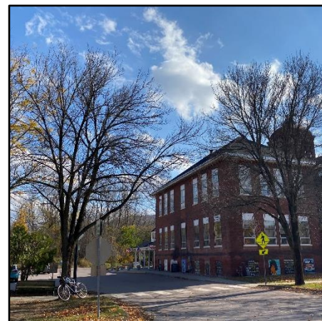
Healthy ash outside Town Center will be treated