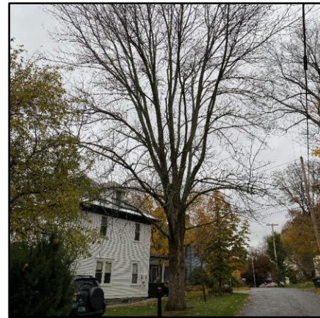
Large, healthy tree on Baker St to be treated.