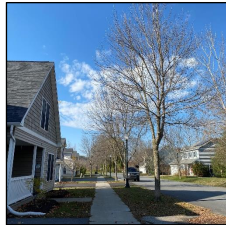
A dozen small ash planted at the same time that Church St neighborhood was developed will be replaced.